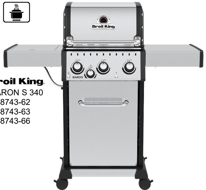
Broil King. BARON S 340 8743-62 8743-63 8743-66