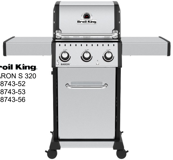
Broil King. BARON S 320 8743-52 8743-53 8743-56