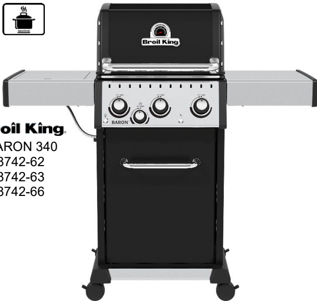
Broil King. BARON 340 8742-62 8742-63 8742-66